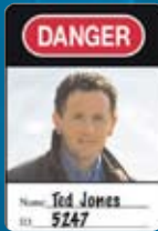
Photo ID label for S31, S33, 406 and 410. Label model S142 available August 2010.

Available Key Retaining (model S31) or Non-Key Retaining (model S33) for use with group lockout.